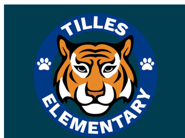
Placement of logo on backgrounds that impact visibility