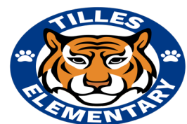
Stretching logo out of proportion